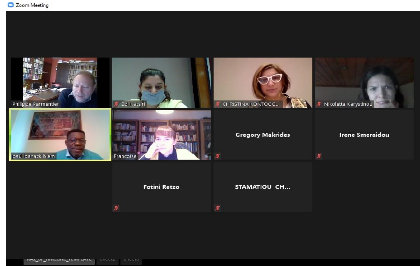
Family Photo from the online C1 Training Activity